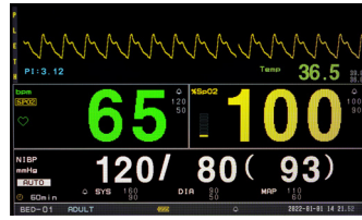
Type B : SpO2 + TEMP