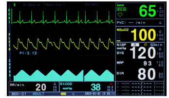
Type D : SpO2 + NIBP + ECG + Respiration + EtCO2