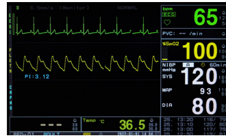
Type C : SpO2 + NIBP + TEMP + ECG